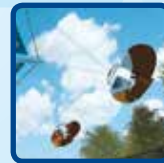
Lake Erie Eagles

Cedar Point | Sandusky, OH | 419-627-2213 | CedarPoint.com