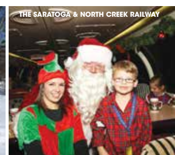
THE SARATOGA & NORTH CREEK RAILWAY