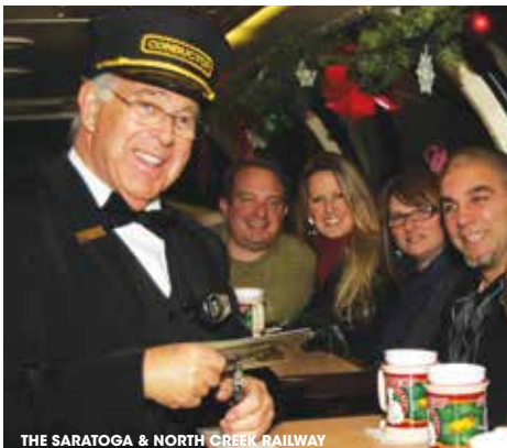
THE SARATOGA & NORTH CREEK RAILWAY

They've also "got" delicious homemade (yes, homemade) sugar cookies, with a lovely hint of vanilla. And then ... what to our wondering eyes appeared? Look, out the window ... why it's, it's, the North Pole! (And just 30 minutes from Saratoga Springs too; boy, that train moves quickly.) With a lurch and a jerk, Santa boarded the train, greeted each child and gave everyone a special gift: a jingle bell cut directly from his sleigh. But the North Pole is a busy place this time of year, so we were soon on our way back to Saratoga Springs to continue our weekend getaway.