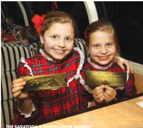
THE SARATOGA & NORTH CREEK RAILWAY